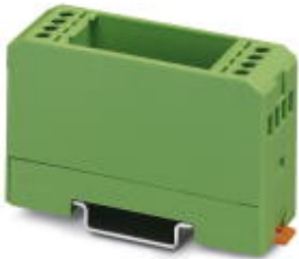
Electronic housing, with snap foot for DIN rail EN 50022 for PCB insertion, without screw connection terminal blocks and cover

Please be informed that the data shown in this PDF Document is generated from our Online Catalog. Please find the complete data in the user's documentation. Our General Terms of Use for Downloads are valid ( http://phoenixcontact.com/download )