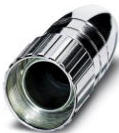
Cable connector, straight, Screw locking, M23, shielded: yes, cable diameter range: 2 mm ... 10.5 mm

Please be informed that the data shown in this PDF Document is generated from our Online Catalog. Please find the complete data in the user's documentation. Our General Terms of Use for Downloads are valid ( http://phoenixcontact.com/download )